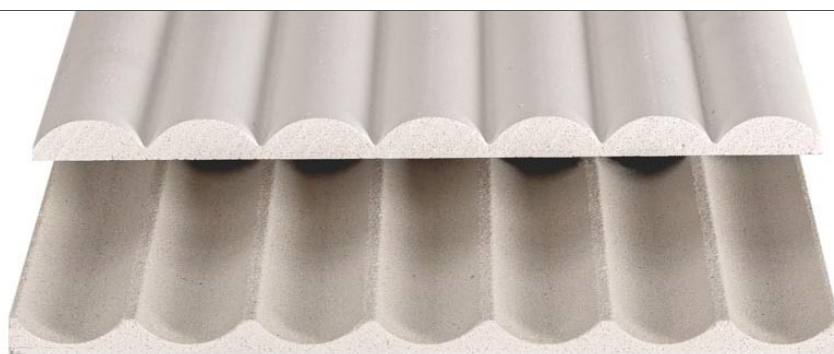
CIMENTO® BARENA 3.0 convex and concave

CIMENTO® BARENA 3.0 is a product of the CIMENTO® designed to allow the coating of pre-existing structures. The slabs are composed of a cement agglomerate to which a fiberglass net is joined. CIMENTO® BARENA 3.0 is an incombustible product.